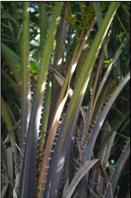
Syagrus schizophylla petioles in the Beck Garden