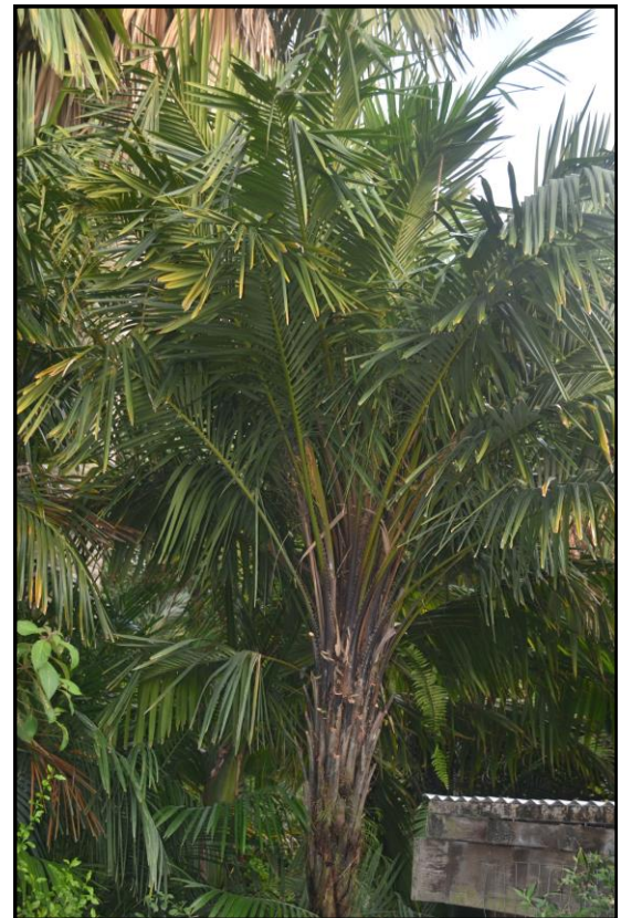
Syagrus schizophylla 23 years old in the Beck Garden